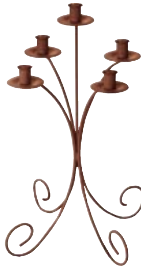
Gatherings (P7434) Suggested Retail: $54.95 Sale Price: $16.00