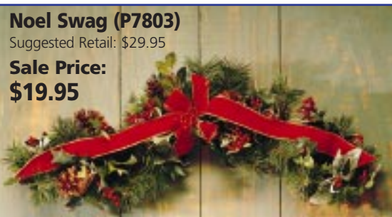
Noel Swag (P7803) Suggested Retail: $29.95 Sale Price: $19.95