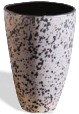
Cobblestone Vase (P7450) Suggested Retail: $29.95 Sale Price: $19.95