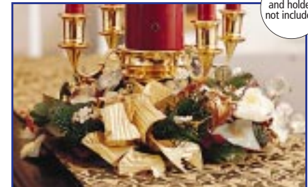
Deck the Halls Ring, 3" (P7817) Suggested Retail: $19.95 Sale Price: $12.95