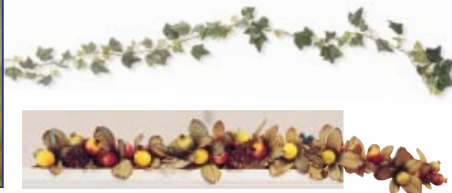
Ivy Vine, 6' (P0390) Suggested Retail: $10.95 Sale Price: $7.95