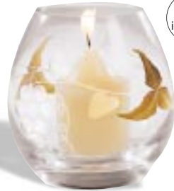
Tuscany Votive Holder (P7138) Suggested Retail: $24.95 Sale Price: $15.95