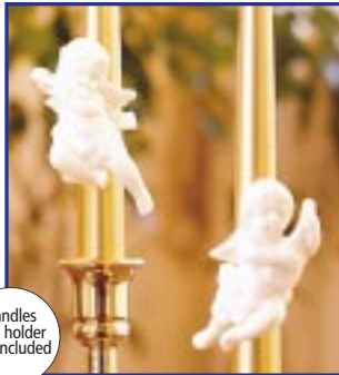
Cherub Candle Followers (P0190) Suggested Retail: $9.95/pair Sale Price: $5.00/pair