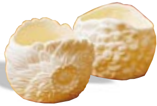
May Flowers (P7134) Suggested Retail: $17.95/set Sale Price: $12.95/set